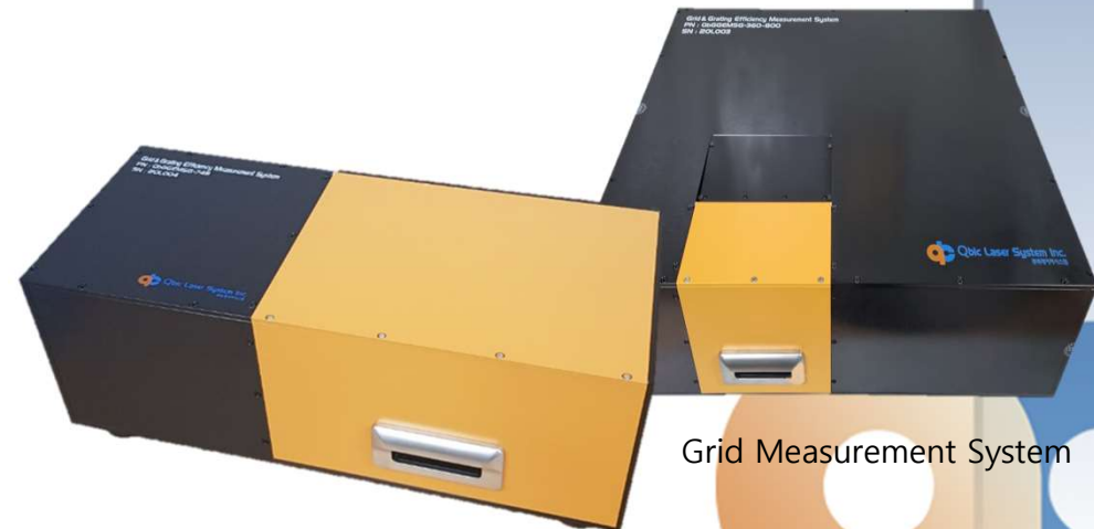
Grating Measurement System