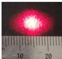
Magnification : X2.5 (for 6mm beam)