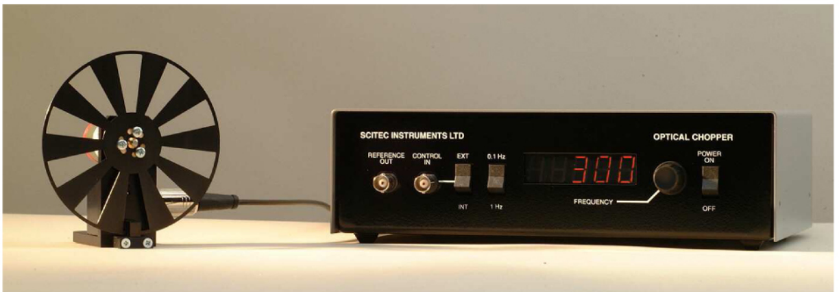
↓ Model 300CD